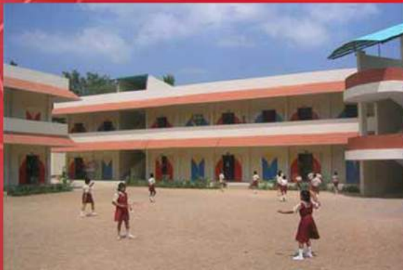
GST Road Campus Estd. 2005