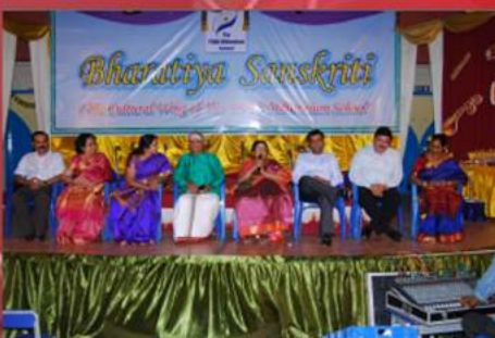
All dignitaries on stage to formally inaugurate Bharatiya Sanskriti and dedicate it to the School.