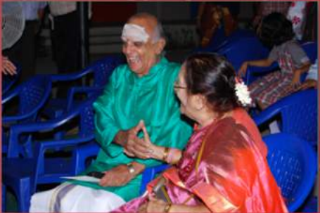
Mr. Umayalpuram K. Sivaraman and the late Dr. Mrs. YGP sharing a light moment before the first ever performance.