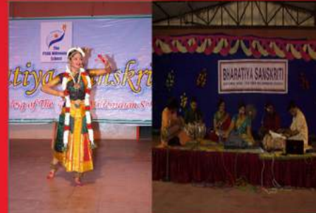
Some of the earliest PSBBM student performances at Bharatiya Sanskriti.