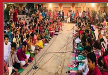
'Millenniumil Thiruvaiyaaru' - a congregation of budding Carnatic musicians at the GST Road campus for a microcosmic display of the essence of Thiruvaiyaaru during the month of Margazhi.