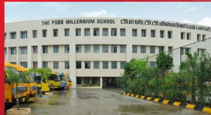
Gerugambakkam Campus Estd. 2009