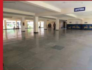
The Cafeteria area