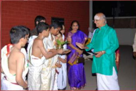
Mr. Umayalpuram K. Sivaraman arrives to inaugurate the Cultural Wing of PSBBM - Bharatiya Sanskriti.