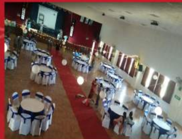
A view of the MPH